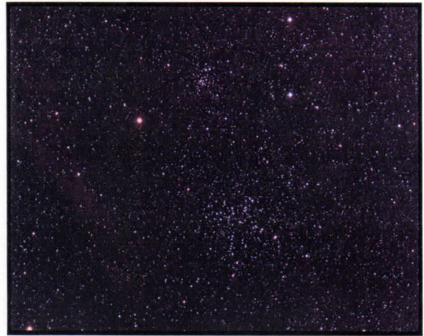
Above: M38 & IC 1907, two open clusters in Auriga. M38 was not discovered by Charles Messier, although it appeared in the 1 st edition of his list published in 1771. It was discovered by Guillaume Le Gentil, a French astronomer, in 1749.

the club last November. A handful of sunspots can be seen, but they literally pale in comparison to lovely Venus drifting slowly across the Sun's disk.