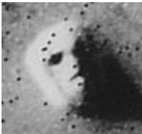
Above: The Martian Face. (The black dots on the photo are not part of the martian landscape, they are data errors.)